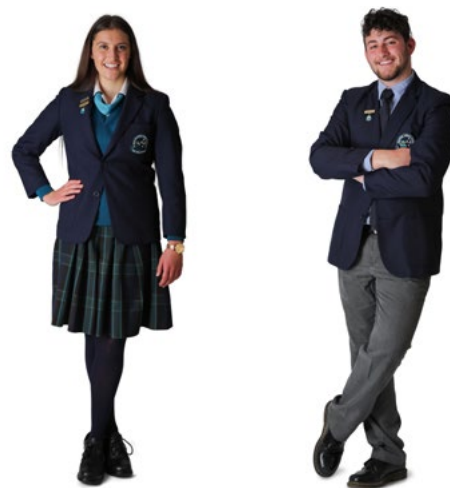
Senior Winter Uniform