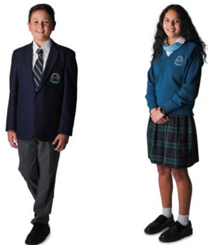
Junior Winter Uniform