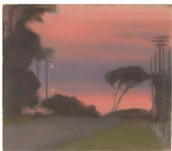
Clarice Beckett, Australia 1887 – 1935 Evening landscape c 1925

Place made Melbourne, Victoria, Australia Materials & Technique paintings, oil on cardboard